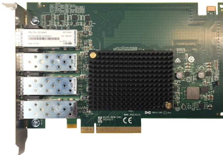
Figure 3. ThinkSystem Emulex OCe14104B-NX PCIe 10Gb 4-Port SFP+ Ethernet Adapter

The following figure shows the ThinkSystem Emulex OCe14104B-NX PCIe 10Gb 4-Port SFP+ Ethernet Adapter.