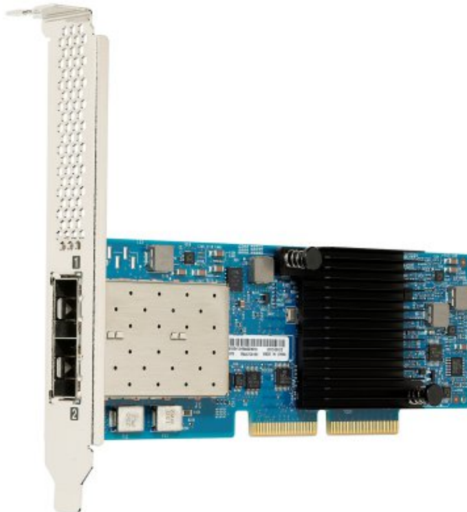
Figure 1. Emulex VFA5.2 ML2 Dual Port 10GbE SFP+ Adapter

The following figure shows the Emulex VFA5.2 ML2 Dual Port 10GbE SFP+ Adapter.