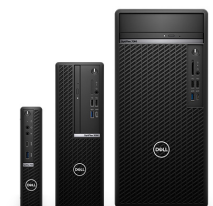
OPTIPLEX DUST FILTERS

Thermally tested custom cable covers offer an easy to install and attractive way to manage cables and secure ports.