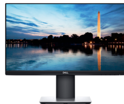
DELL 22 MONITOR - P2219H

23.8" ultrathin bezel optimized for dual display productivity. Easy Arrange feature enables multitasking efficiency and its small base frees valuable workspace.