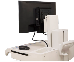
OPTIPLEX MICRO DUAL VESA MOUNT WITH ADAPTER BRACKET

This mount allows the Micro to be VESA mounted to select Dell E Series displays.