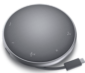
DELL MOBILE SPEAKERPHONE | MH3021P

Designed to work seamlessly across 3 devices, this compact keyboard mouse combo keeps your desk clutter-free and lets you stay productive with up to 36 months 26 of battery life.