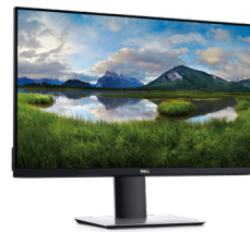
DELL 27 USB-C MONITOR | P2720DC

Easily attach your Dell Dock to the Dell Dock Mounting Kit and mount it behind a monitor, to a wall or under the desk for a clutter-free workspace.