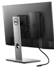
DELL DOCKING STATION MOUNTING KIT | MK15

Work at full speed with Dell's powerful Thunderbolt Dock. Charge your system faster, support up to two 4K displays and connect to your peripherals via a single cable.