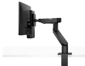
DELL SINGLE MONITOR ARM - MSA20

Mount your system on a wall or under a desk. Includes an adapter box to securely house the system's power adapter.