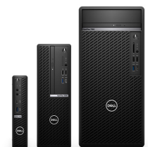
OPTIPLEX DUST FILTERS

Thermally tested custom cable covers offer an easy to install and attractive way to manage cables and secure ports.