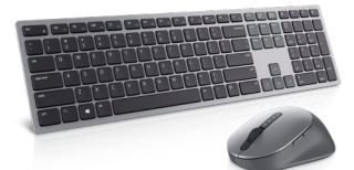
DELL PREMIER MULTI-DEVICE WIRELESS KEYBOARD AND MOUSE - KM7321W

Optimize conference calls and multimedia streaming with exceptional audio clarity. Minimize background noise while on calls with the dual mic array and echo cancellation feature.