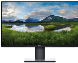
DELL 27 MONITOR - P2720D

See more and do more with a 27" QHD monitor that expands your workspace and gives you a better view of all your important tasks.