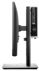
OPTIPLEX MICRO ALL-IN-ONE STAND

Small footprint mounting solution adapts to your environment, with cable management and monitor height adjustability, tilt, swivel and pivot functions.