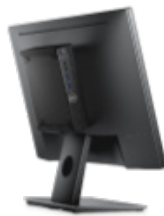
OPTIPLEX MICRO ALL-IN-ONE MOUNT FOR DELL E SERIES MONITORS

Small footprint mounting solution adapts to your environment, with cable management and monitor height adjustability, tilt, swivel and pivot functions.