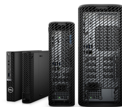
OPTIPLEX CABLE COVERS

Experience exceptional audio clarity with this Teams certified wired headset that allows you to wear the microphone on either side for a customized fit.