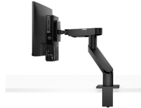
OPTIPLEX MICRO DUAL VESA MOUNT WITH ADAPTER BRACKET

This mount allows the Micro to be VESA mounted to select Dell E Series displays.