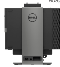
OPTIPLEX SMALL FORM FACTOR ALL-IN-ONE STAND

Minimize your footprint with this arm that offers easy installation and enhanced adjustability while keeping cables neatly hidden from view.