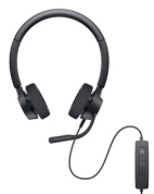
DELL PRO WIRED HEADSET - WH3022 (COMING SOON)

Wired mouse with fingerprint reader offers convenient and secure login and online access without passwords.